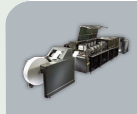
Equipment featuring Enterprise High Speed Ink Jet

Enterprise High Speed Ink Jet is an affordable product with superior performance for the high-volume ink jet segment of the bill and statement market. Ask your Enterprise Group Account Manager for more information on Enterprise High Speed Ink Jet.